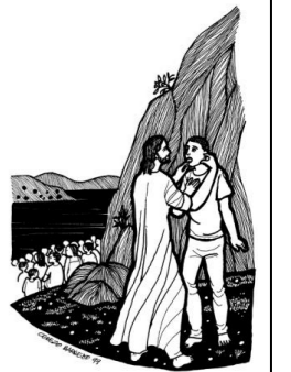
By Flor McCarthy SDB

REFLECTIONS ON THE READING... The gift of hearing is a precious gift. But it is only with the heart that we can hear rightly. The cry of a needy person may reach our ears, but unless it reaches our heart we will not feel the person's pain, and it is unlikely that we will respond. And the gift of speech is a precious gift. But again it is only with the heart that we can speak rightly. For our words to ring true, they must come from the heart. If they come only from the lips, they will have a hollow sound and will have little effect. They will be like a wind that ruffles the surface of the water but leaves the depths untouched. But words that come from the heart, enter the heart.