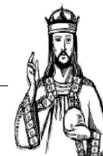
CHRIST THE KING

The puzzle is based on Luke 23:33-43 (NIV).